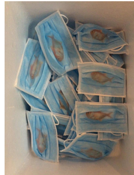
03 Image source: Courtesy of the artist Tran Tuan (2016).

The material extension of our faces not only makes breathing hard—it also changes our sensorial world. Talking, touching, smelling, and tasting all become cumbersome. Noa Hegesh, a historian working on sound, asks how