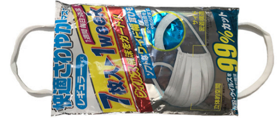
02 Turning a packaged mask into a mask. The text reads "Comfortable fresh masks (regular size) Hygienic all week. Includes 7 pieces one week. Protects against virus aerosols!! Soft wide ear straps. Softens the stress put upon the ears. Keeps out 99% of pollen/virus particles." Collage by Jadie Iijima, 2002.

body shapes. Developed for predominantly male bodies of soldiers and miners, the respirators fail to account for the feminization of care work in the medical sector where the personal protective gear is most needed at the moment. Rather than neutral objects, the seemingly universal mask becomes a signal for gendered aspects of care work and for vulnerability amidst the pandemic.